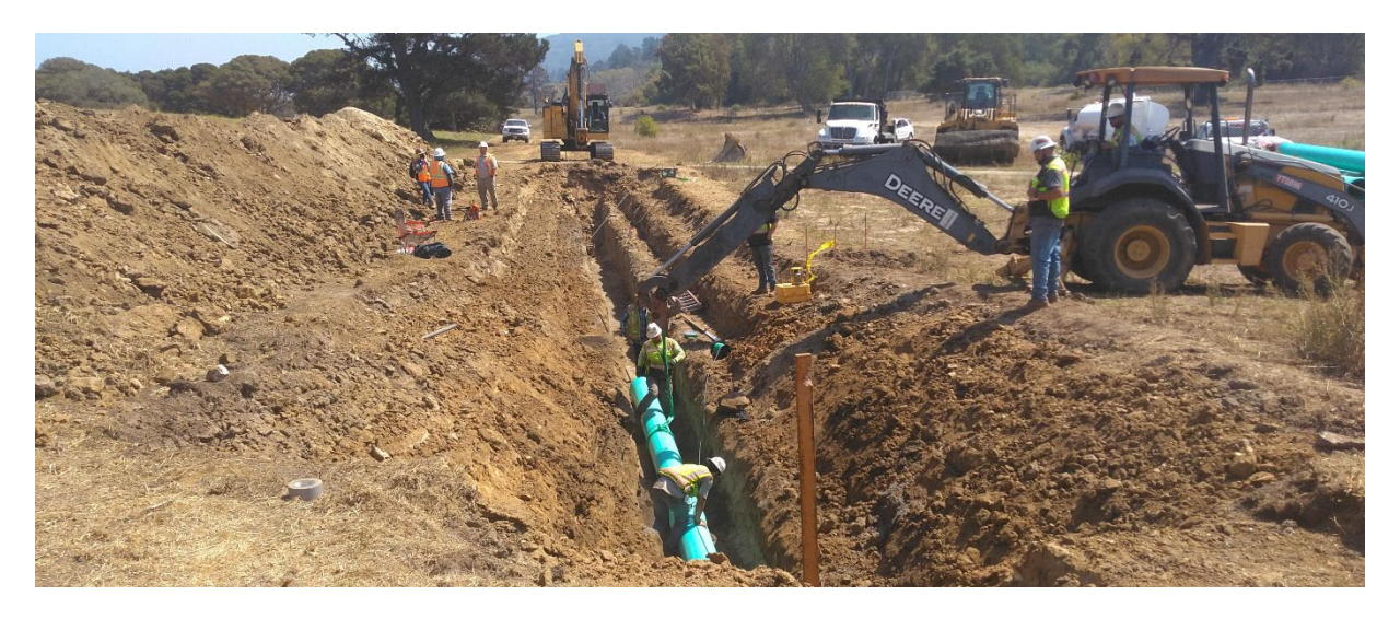
Graniterock Construction Co. trenching and installing new 16" sewer line

Underground water lines and electrical conduits were marked and potholed for avoidance, and the public has been rerouted around the construction site. Even so, the contractor accidentally struck two water lines during trenching but were promptly repaired. This project is scheduled to continue through the end of October.