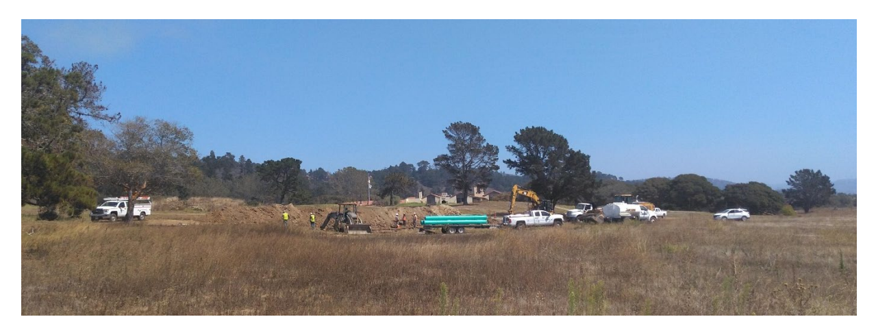
Worksite with Rancho Canada Clubhouse in background