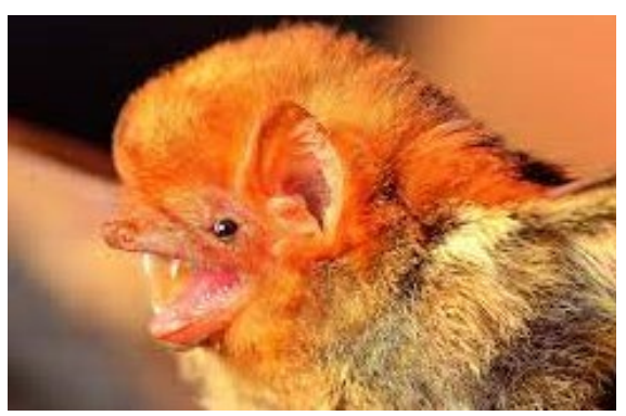
W. Red Bat (Lasirurs blossevillii)