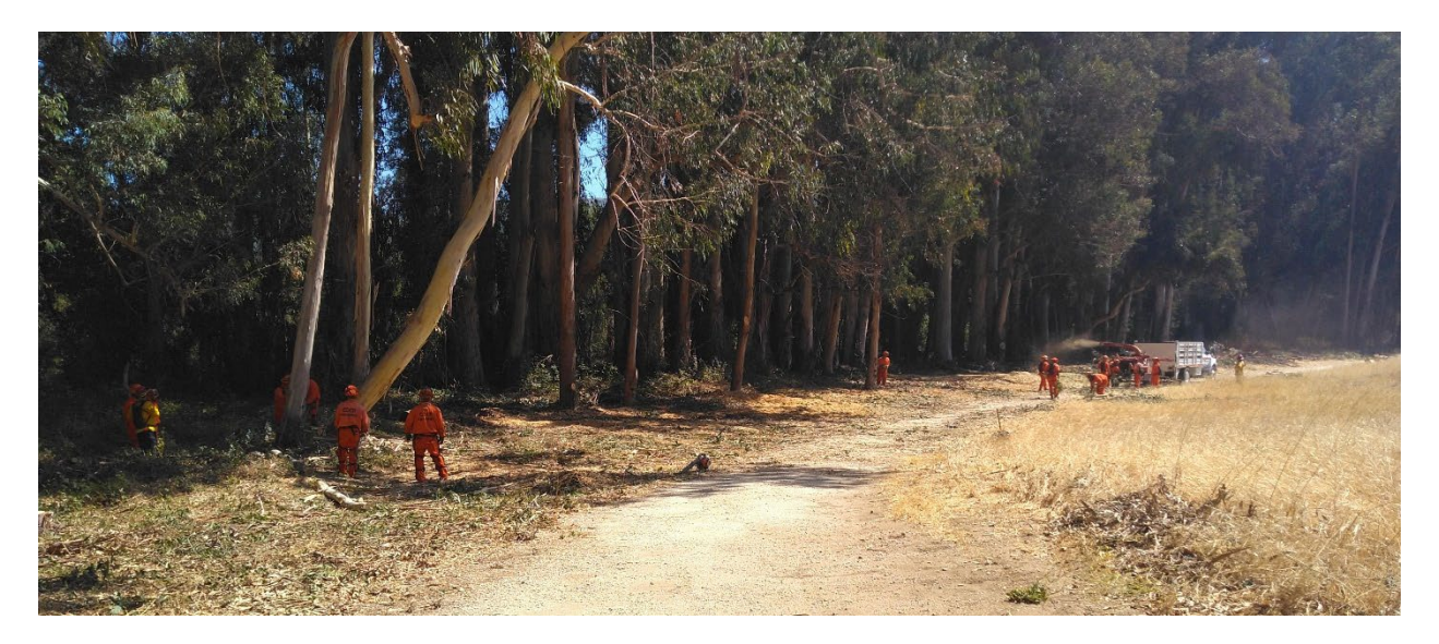
Gabilan Conservation Camp inmate crew chipping brush and raking along the Rancho Loop Trail