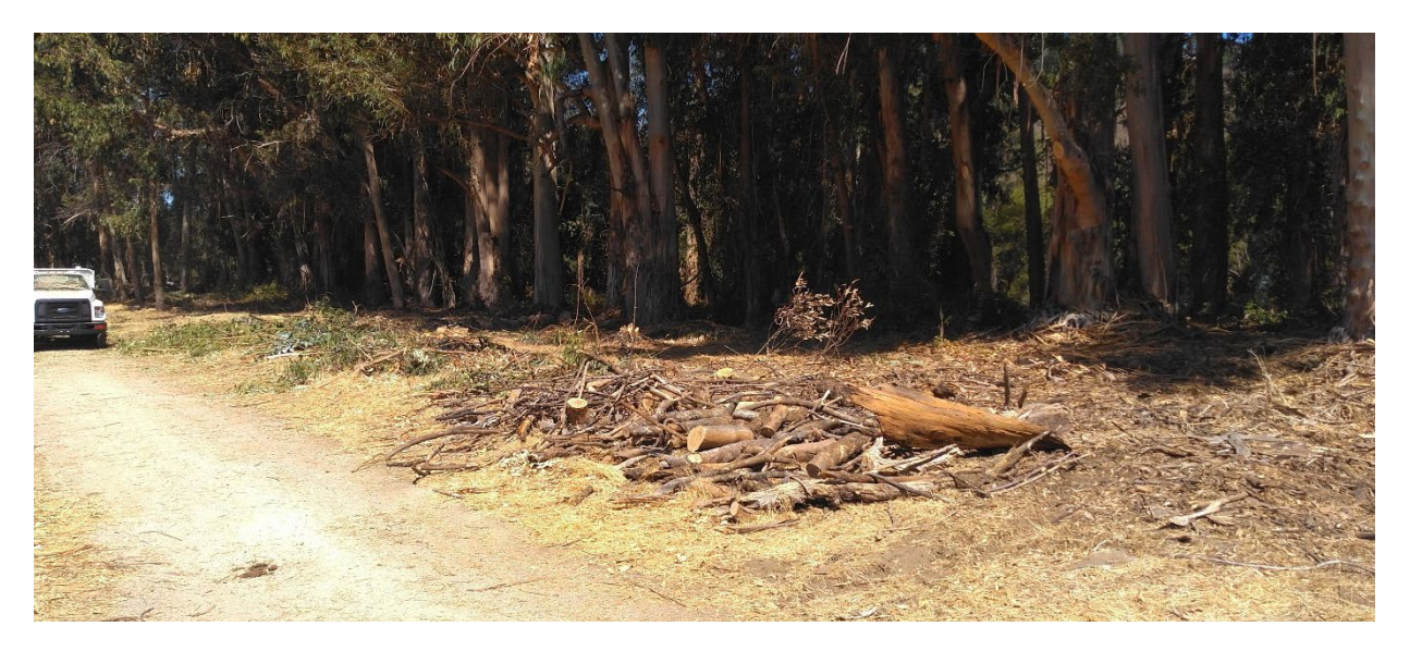
A newly constructed 30' fuel break along the Rancho Loop Trail

Ops staff met with Resource Conservation District of Monterey County personnel and Regional Government Services (the District's grant writer and consultant) to develop a strategy for pursuing grant funding and help draft the Plan's RFP.