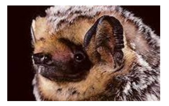
Hoary Bat (Lasiurus cinereus)