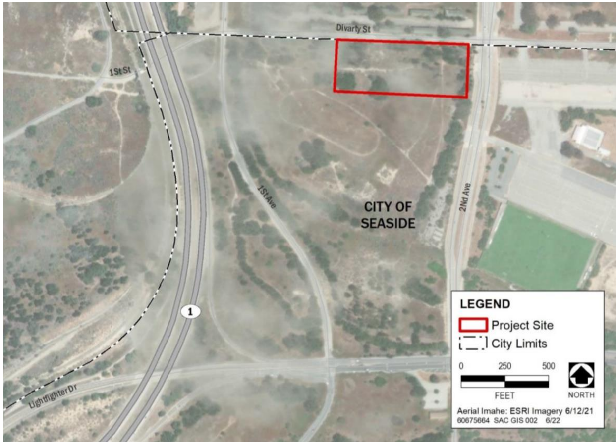
Diagram Depicting Monterey County Courthouse Site