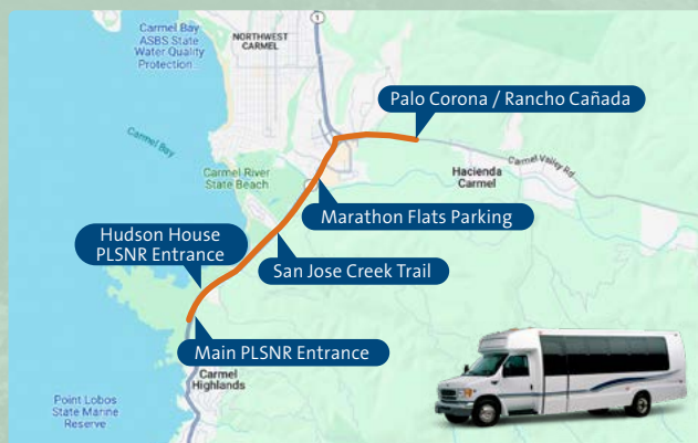
Point Lobos Reserve Shuttle Van Proposed Route & Stops

LEARN MORE: parkitforparks.com/solutions