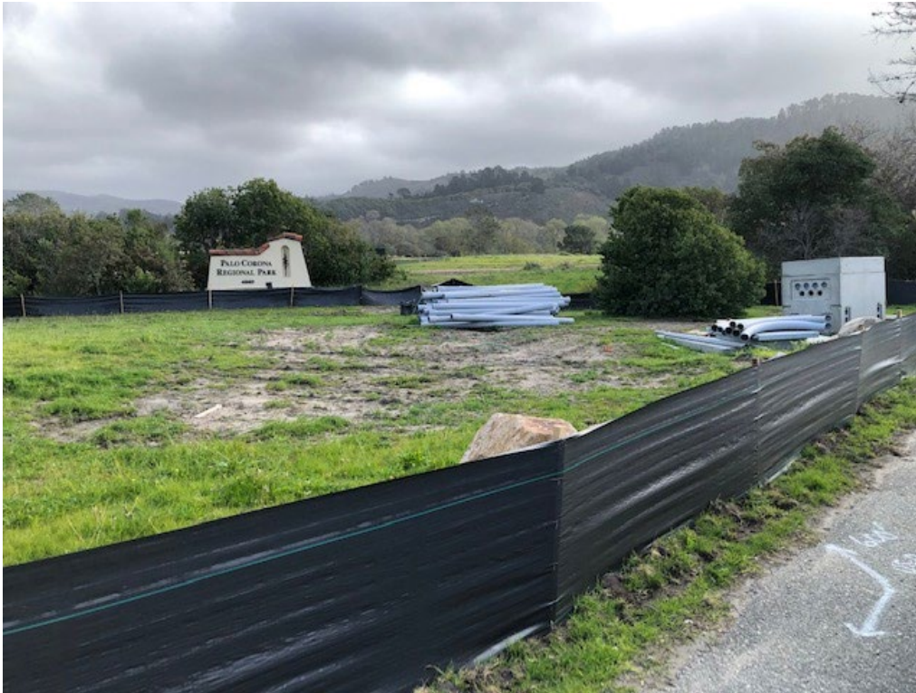
Exclusionary fencing around area of new PG&E transformer