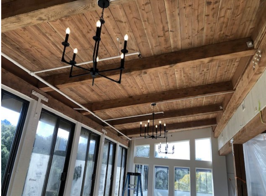
New light fixtures sandblasted ceiling (continued)