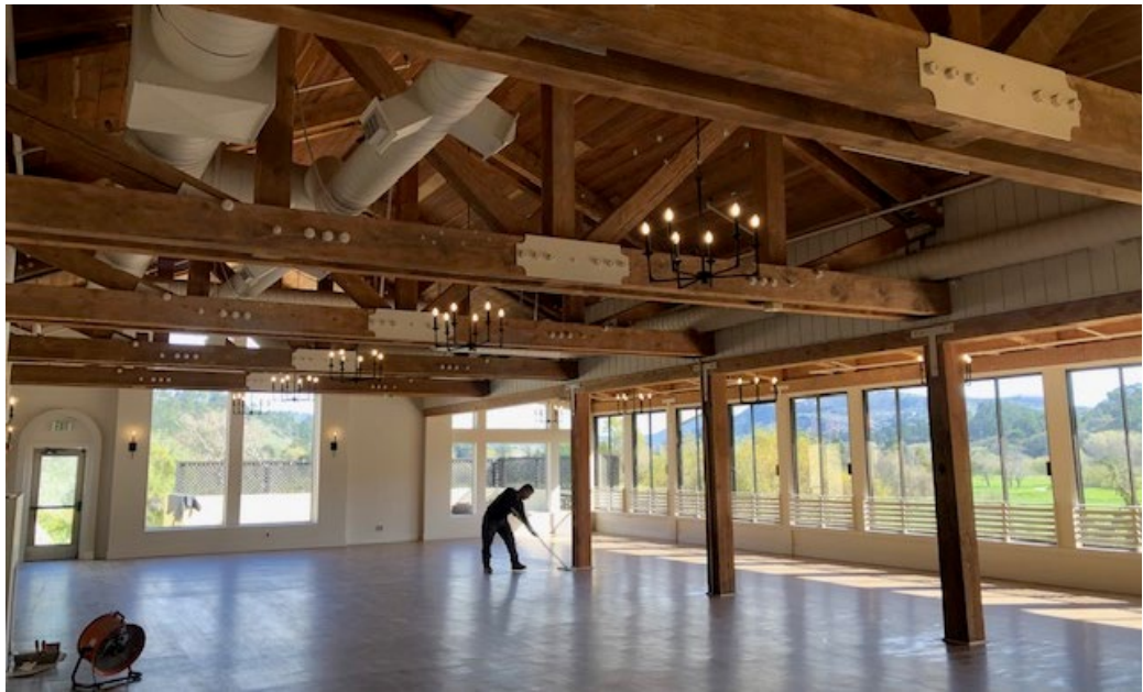
New light fixtures, laminate flooring, and sandblasted ceiling,