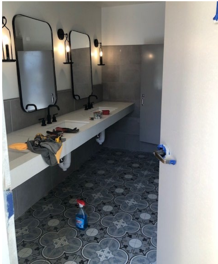
Newly remodeled restrooms