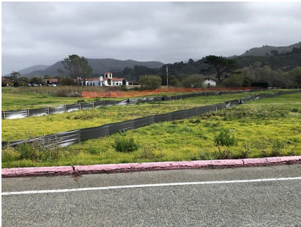
Exclusionary fencing along PG&E main line path (cont'd)