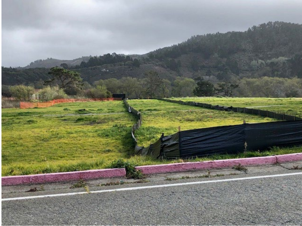
Exclusionary fencing along PG&E main line path