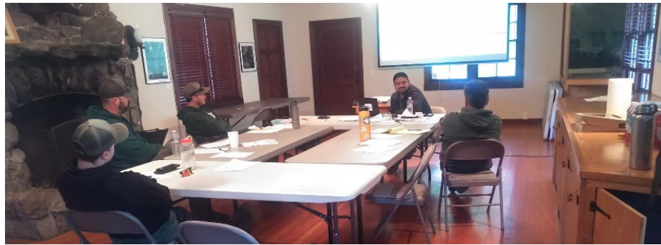
Rangers attending training at GRRP's Meeting Room

Rangers took a break from storm damage recovery to participate in a full day of training provided by the District's insurer, California Joint Powers Insurance Authority. Topics included Lockout/Tagout Procedures, GHS/Hazard Communication, Hand & Portable Power Tool Safety, and Basic Electrical Safety.