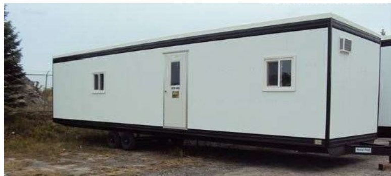
Example of a Portable Office Trailer

Rangers are exploring the purchase, lease, or "rent to own" of a portable construction office-type trailer. Ideally, this portable structure will be utilized as a temporary Ranger station and office until funding for Project-A is secured. MPRPD's Board previously authorized the planning and design of Project-A, which includes a Ranger office facility, about the time when MPRPD's Board authorized Project-B to proceed. This temporary office will allow more Rangers to be stationed at Palo Corona Regional Park and will be located adjacent to the Rancho Canada Unit's maintenance shop.