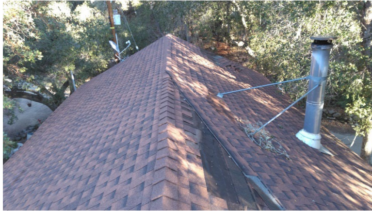
CCC Apartment Roof

The small apartment’s roof needs to be replaced due to the extreme conditions during last summer’s and this winter season’s severe weather. This structure is located in proximity to the Cachagua Community Center. The project is being coordinated by Rangers, along with Regional Government Services and MPRPD’s Administration Division staff.