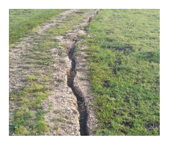
"Channeling" on Barn Trail

Rangers are getting caught up on addressing storm damage that (at the time) was not significantly impacting public safety and/or access during the winter months. Many of these items, such as erosion along Barn Trail at PCRP (see below), were documented and monitored but not addressed immediately, with the understanding we would revisit these items once weather was cooperative and soil conditions were favorable. Rangers will continue to address these items prior to fully transitioning into mowing and brushing of MPRPD's trails and roadways, as soil is presently in prime condition for trail work and reconstruction.