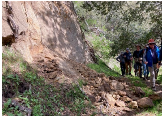
Slide along Whisler Trail