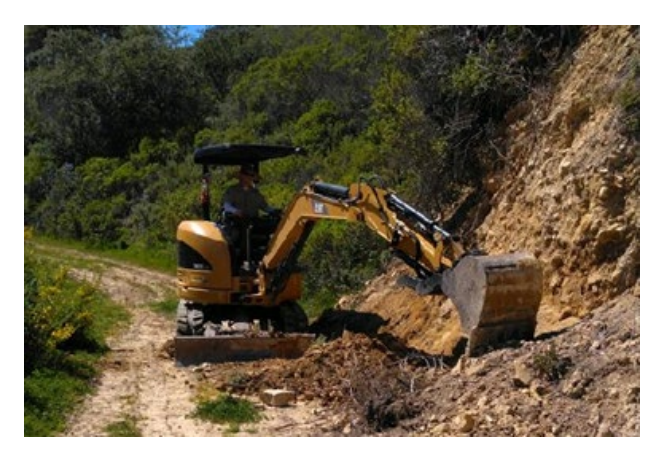
Slides on Palo Corona Trail