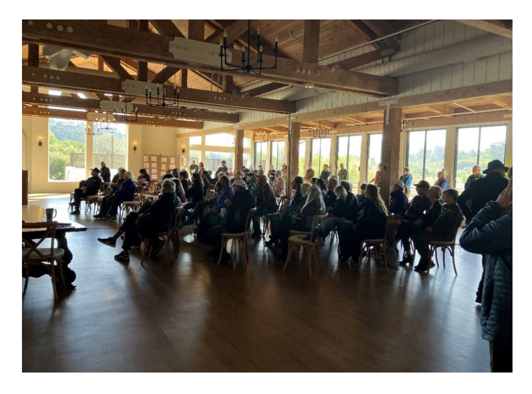
Carmel River Watershed Conservancy's Welcome included Speakers and Panelists