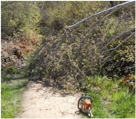
Rangers Removing Fallen Tree at PCRP