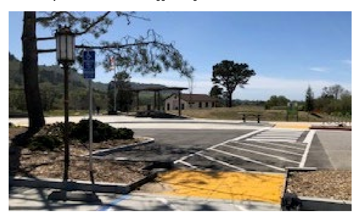
Grantor acknowledgement sign installed at Project B entrance (parking lot view)

A permanent grantor sign was prominently installed at the entrance to the Project-B site. This highly visible sign memorializes Proposition 68's contribution to this project. Project-B's progress reports have been jointly prepared by MPRPD's Project Manager, rangers, and the Ausonio construction management team. Ausonio's team continues to coordinate closely with Wedgewood to ensure no negative impacts affect the concessionaire's events. Tribal Monitors remain on-call to identify and avoid any potential negative impacts to cultural sites when excavation or other disturbance of soil occurs. No cultural artifacts were encountered in the past month. The team has also been working closely with SWCA's biologist to monitor the site for, and to protect, the federally listed California Red Legged Frog.