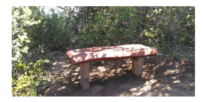
New Memorial Bench on Veeder Trail