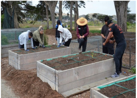
Volunteers Trench Water Lines, Construct Decomposed Granite Paths and Raised Vegetable Garden Beds