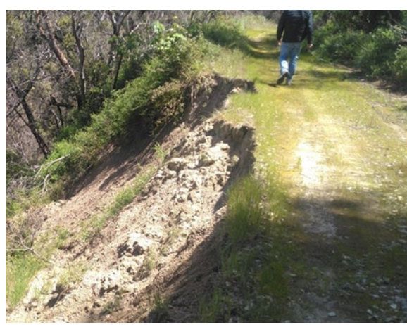
Collapsed and Undermined culvert