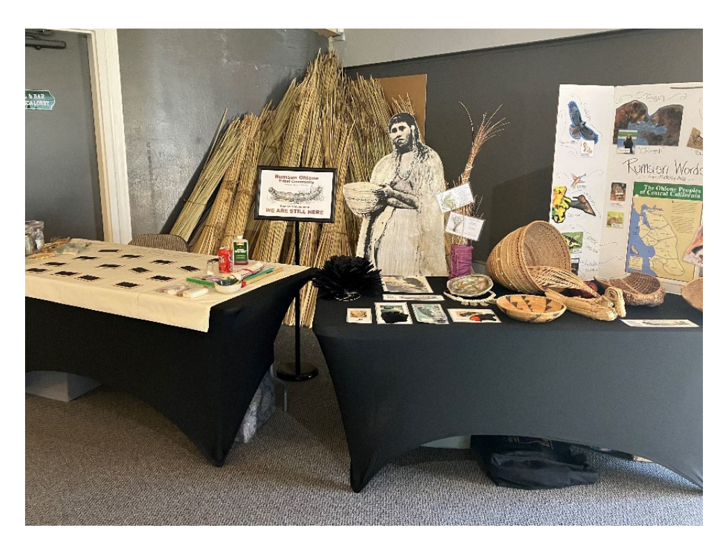
Rumsen Representatives and MPRPD Volunteers and Staff Showcased Exhibits