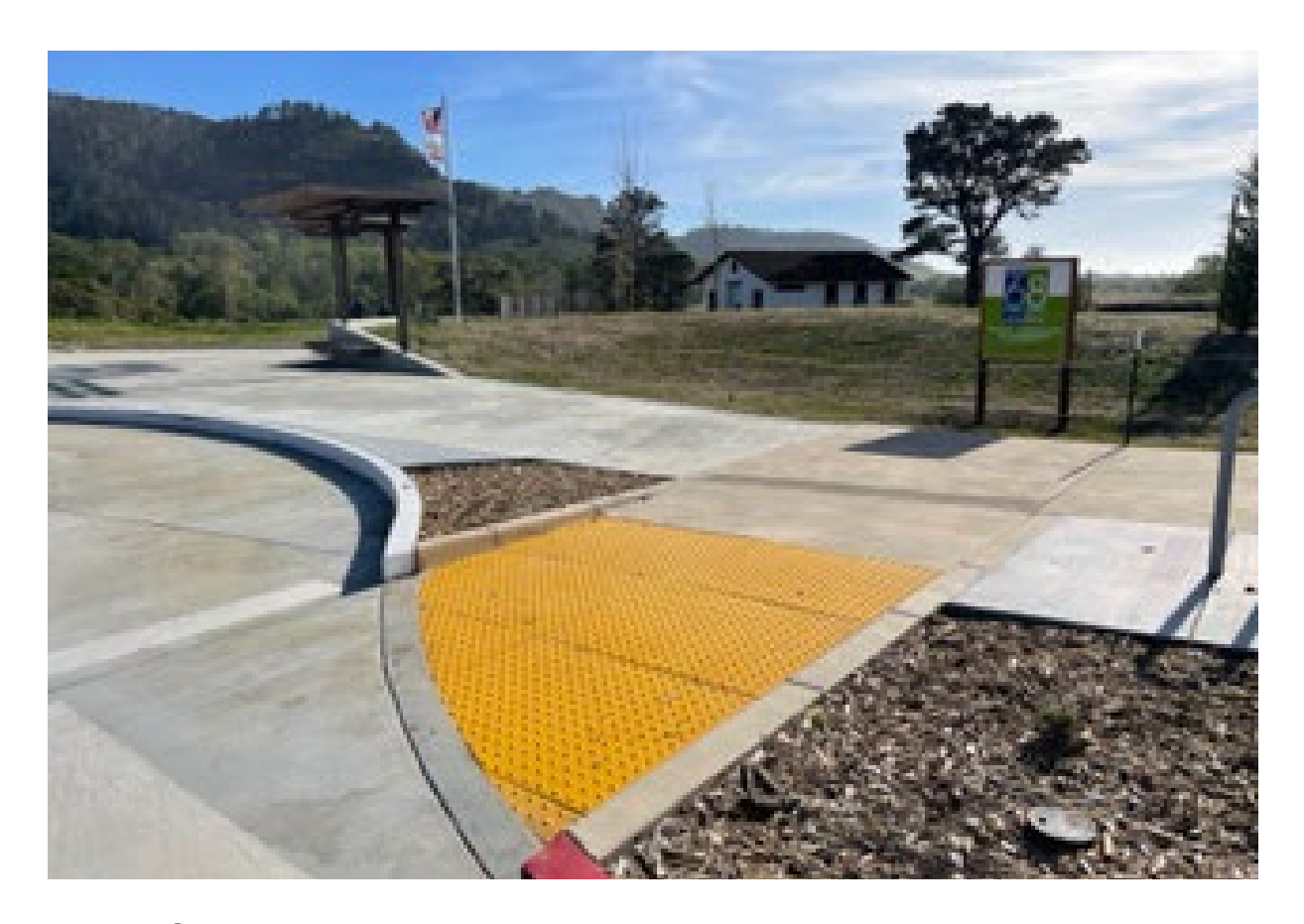
Grantor acknowledgement sign installed at Project B entrance (pedestrian view)