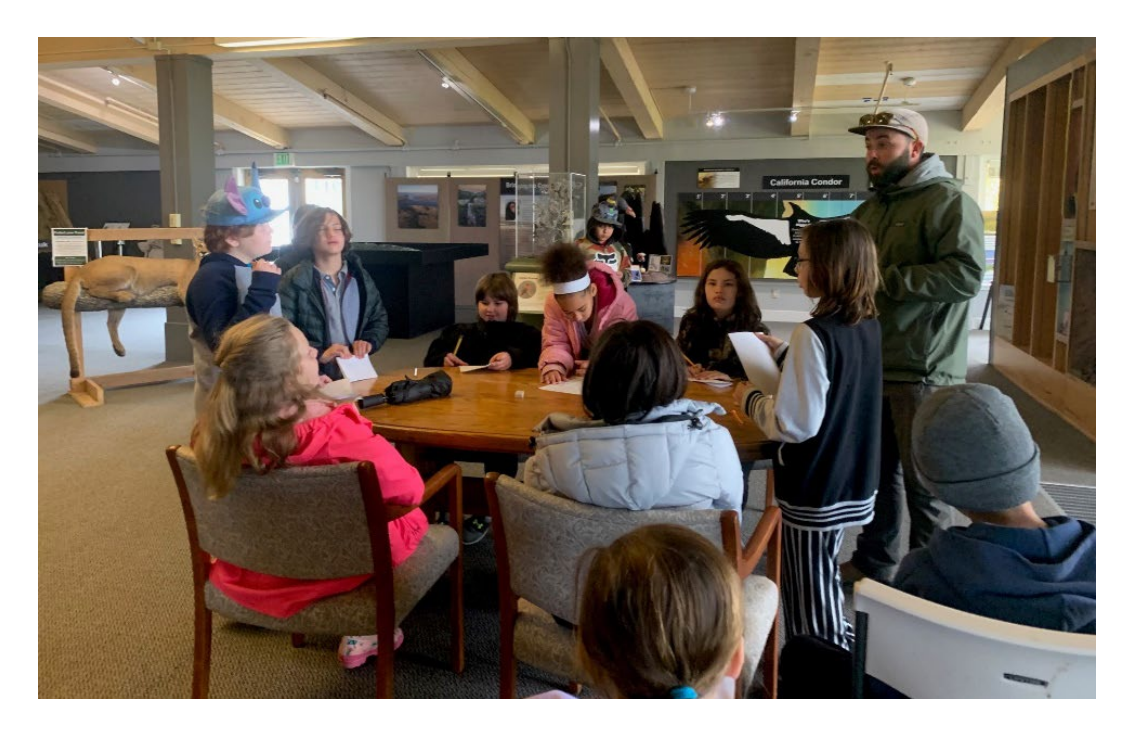
MBCS students share information, reviewing answers to scavenger hunt questions highlighting each of the Discovery Center exhibits

Monterey Bay Charter School (MBCS) students, grades 1, 7, and 8, were delighted by an impromptu visit to the PCRP Discovery Center (DC). The older students completed a bingo-style scavenger hunt connected with the DC exhibits, while the first graders learned about the local mammals of the area by exploring MPRPD's skin and pelt collection. As a result of this enriching visit, staff were able to forge a new educational connection with this local school's faculty.