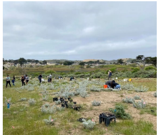
Volunteers Plant Seedlings in Oak Woodland, Native Plant Garden, and Dune Habitats