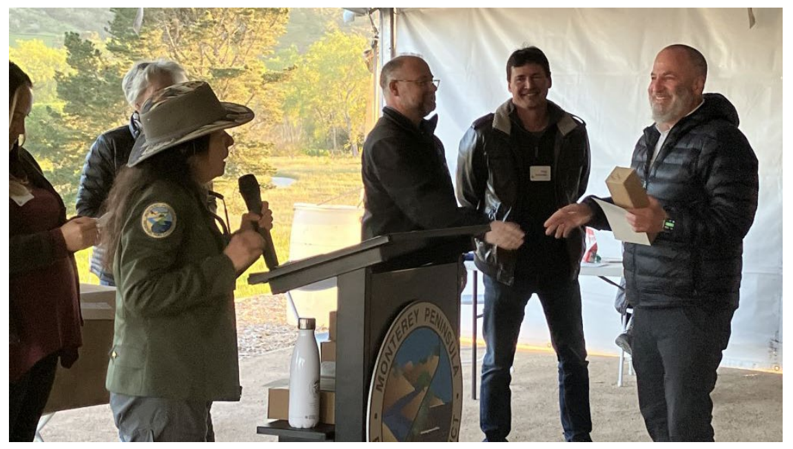
Volunteer Recognition Ceremony