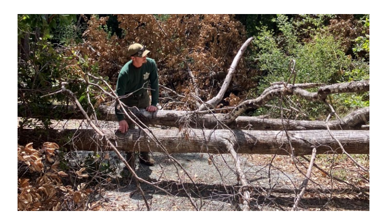
Several Trees Cleared at MCP's Davis House

Rangers were finally able to access Mill Creek Redwood Preserve (MCP) to address the myriad of trees downed across the driveway leading to the Davis House. Clearing these trees provides access for emergency vehicles to conduct structure protection in the event of a wildfire, as well as providing access for our MCP caretaker who monitors this site for illegal activity.