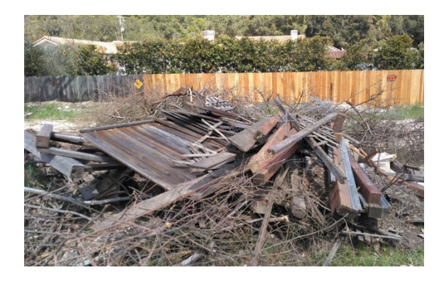
Flood Debris on MPRPD Property