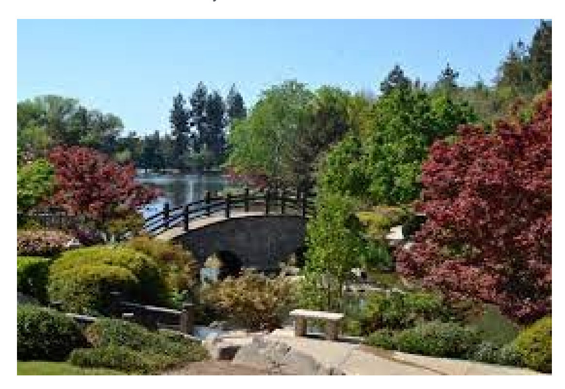
Shinzen Friendship Garden, Fresno, CA

This garden will celebrate the United States' ethnic and racial diversity, commemorate the many contributions made by this nation's Asian citizens, and memorialize the many struggles people of Asian ancestry have suffered and overcome, including the Chinese Exclusion Act of 1882, Executive Order 9066's internment of approximately 120,000 Japanese-Americans and Japanese nationals from 1942 to 1944/45, etc. The garden will also make this park a regional destination and tourism/cultural education-based economic driver for the City of Marina and surrounds.