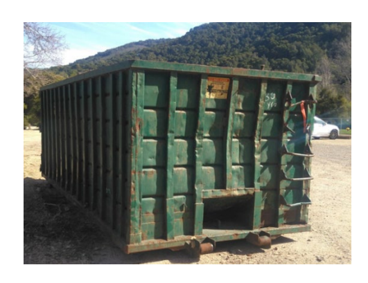
Dumpster Provided by County