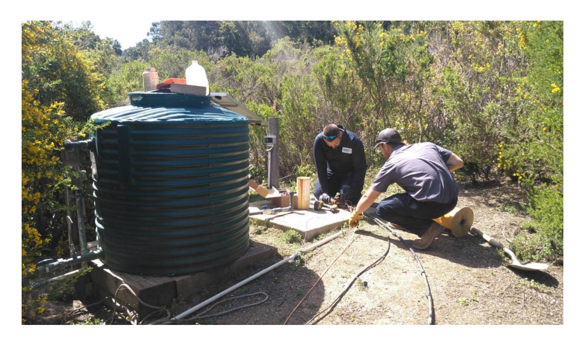
Dougherty's Technicians Working on Mesa Well Pump

drinking water to visitors, canines, and equines at the Mesa, a major destination within GRRP.