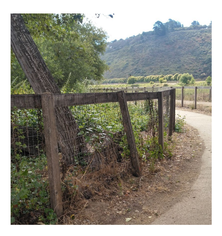
Southbank Trail Fence - North