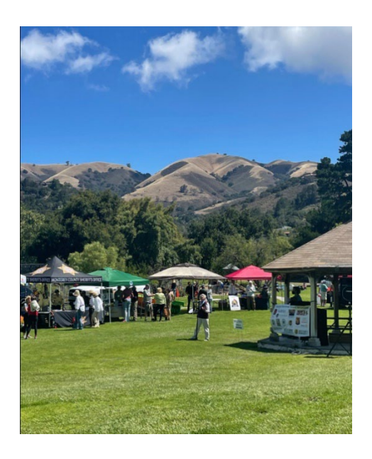
Booths at Wildfire Preparedness Fair

Staff continues to meet monthly with community members of the Fire Mitigation Committee Meeting. Working cross-divisionally, the community members are highly motivated to see the development of a Fuels and Invasive Species Removal Volunteer Program that shall be led by the EECO and OPS divisions.