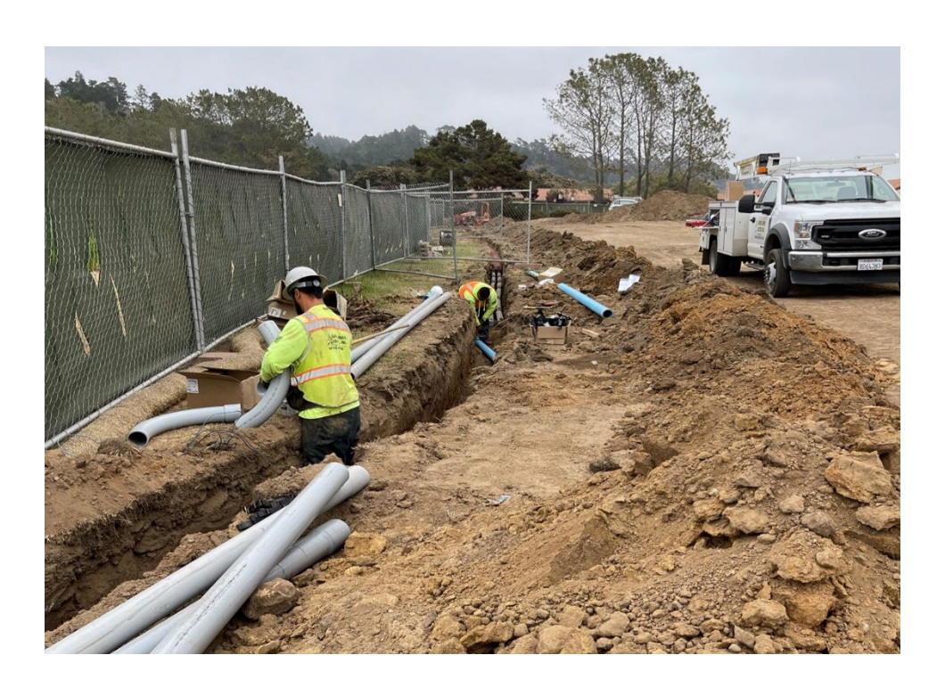
Site Utilities' Installation