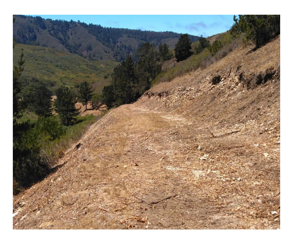
Palo Corona/Quail Meadows Fuel Break - South

6. Parking Lot Improvements at GRRP: Rangers recently constructed an additional section of corral-board fencing at the Garland Ranch Regional Park parking lot. This will prevent visitor-parked cars from encroaching into the bottleneck separating the lower lot and equestrian parking lot.