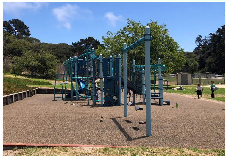
Celebrating the new playground equipment at Del Rey Oaks Park

iii. Cachagua Country Fair – Tabling Outreach – July 9, 2022: MPRPD Staff provided an outreach booth for the annual Cachagua Country Fair - the first one post COVID! The booth's foci were two-fold: (1) General outreach about the natural history, parks, and open spaces MPRPD provides; (2) Community feedback on the priorities for amenities and infrastructure improvements at the Cachagua Community Park.