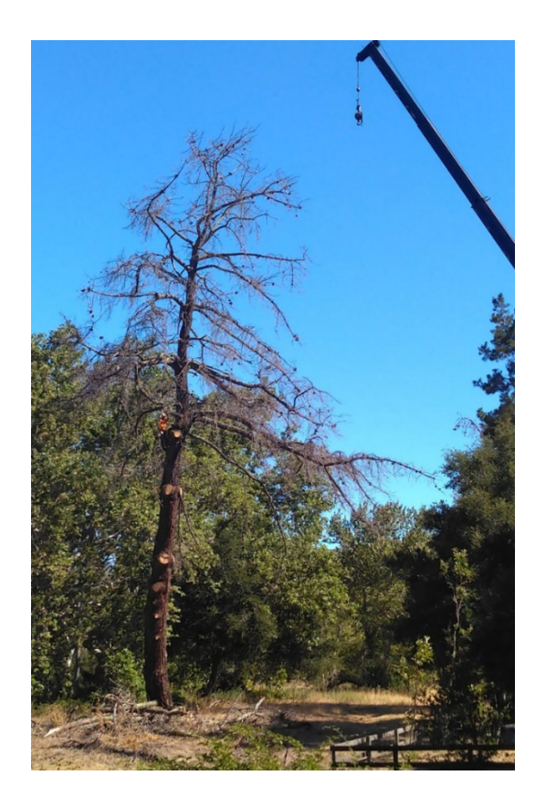
80' dead pine tree being removed at GRRP