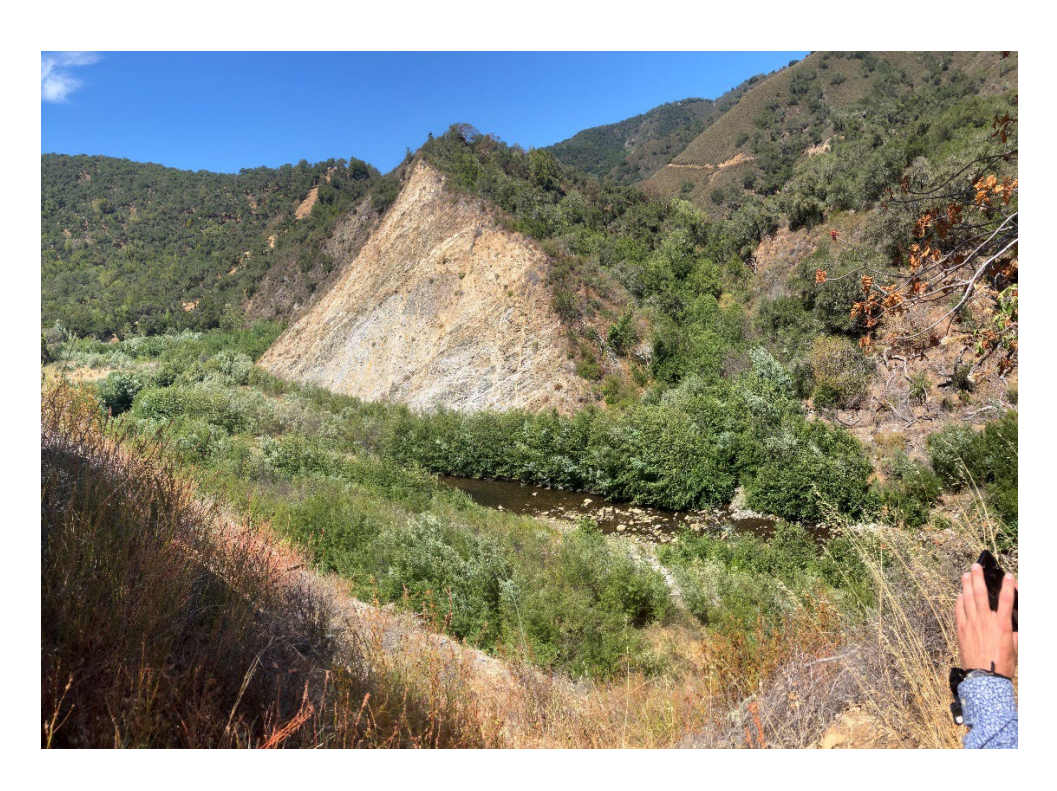
Restored Dam Site