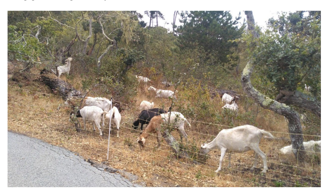
Goats grazing fire fuels at Laidlaw-Apte Preserve

3. Goats at Laidlaw-Apte Preserve: Goats were utilized by Cal Fire at MPRPD's Laidlaw-Apte Preserve to reduce ladder fuels and vegetation from July 7 thru 11 2022. The goats received a warm welcome from adjacent property owners and the surrounding neighborhood. Additional fuel mitigation projects are being considered, including goats, large woody debris removal and/or mastication.