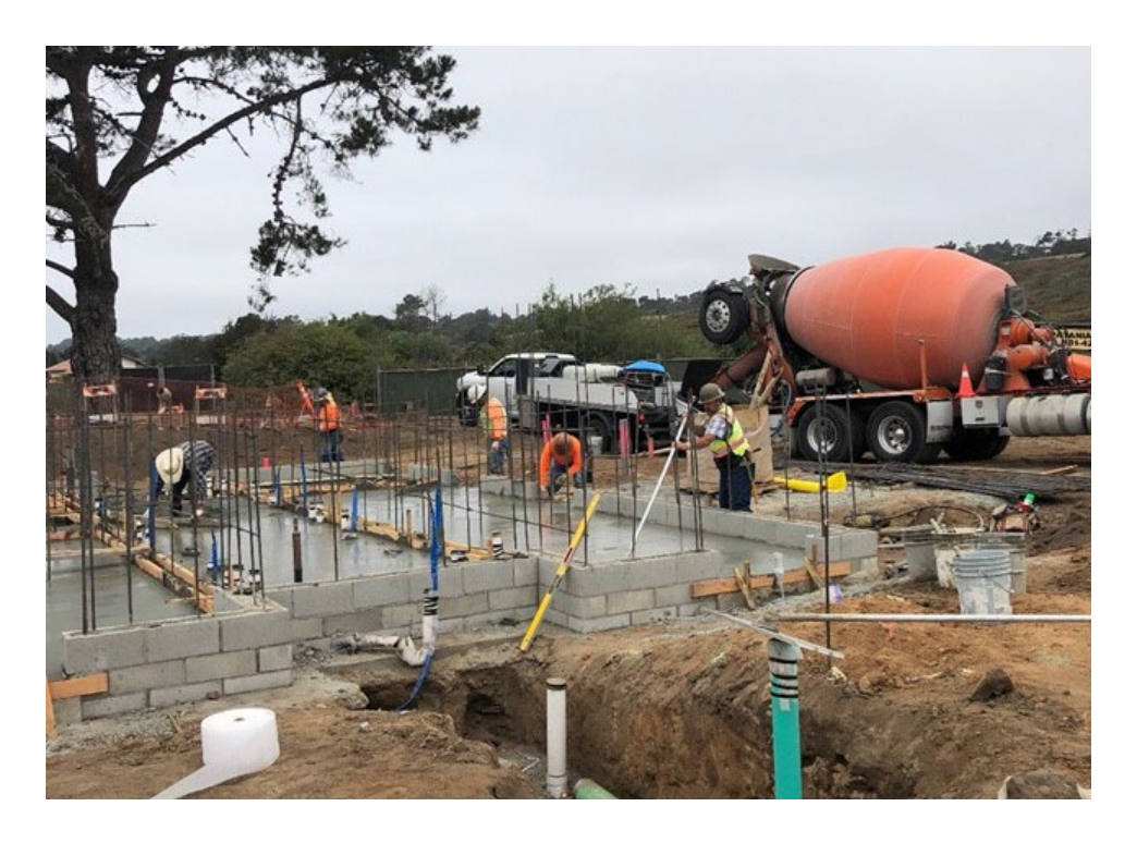
Restroom Building's Concrete Foundation Placement