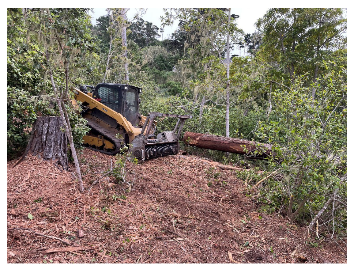
Figure 2: Chipping of downed logs and ladder fuels to restore more natural levels of downed wood and vegetation density.