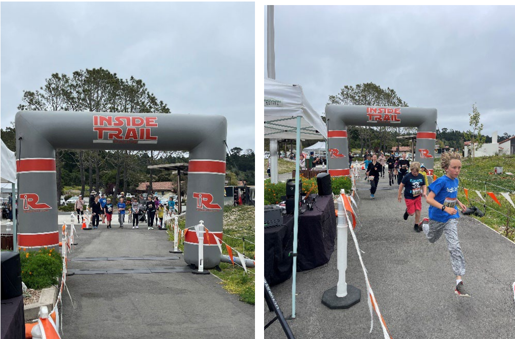
Runners at the Fun Run prepare at the start line and finish the race with enthusiasm.

PCRP. Four routes were offered, from an 8.5-mile, one-way course from Williams Canyon, a 9.5-mile to Ishxenta State Park and back, a 21-mile Adventure Course to Mitteldorf and back, and a 2-mile Fun Run. The BSLT was able to raise $3,060 out of $10,000 at the event.