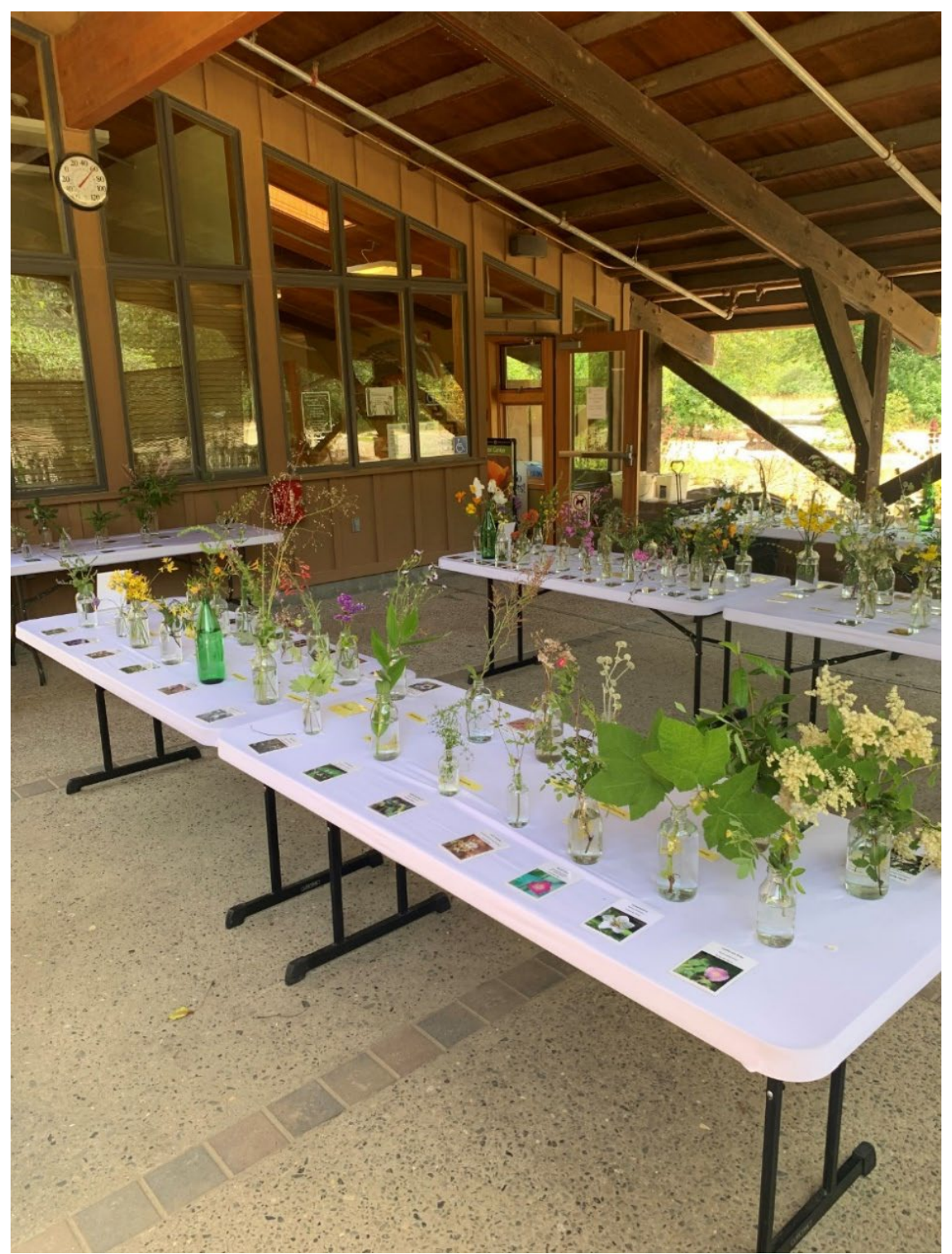
Wildflowers are on display at the Garland Visitor Center Patio during the second week of June.