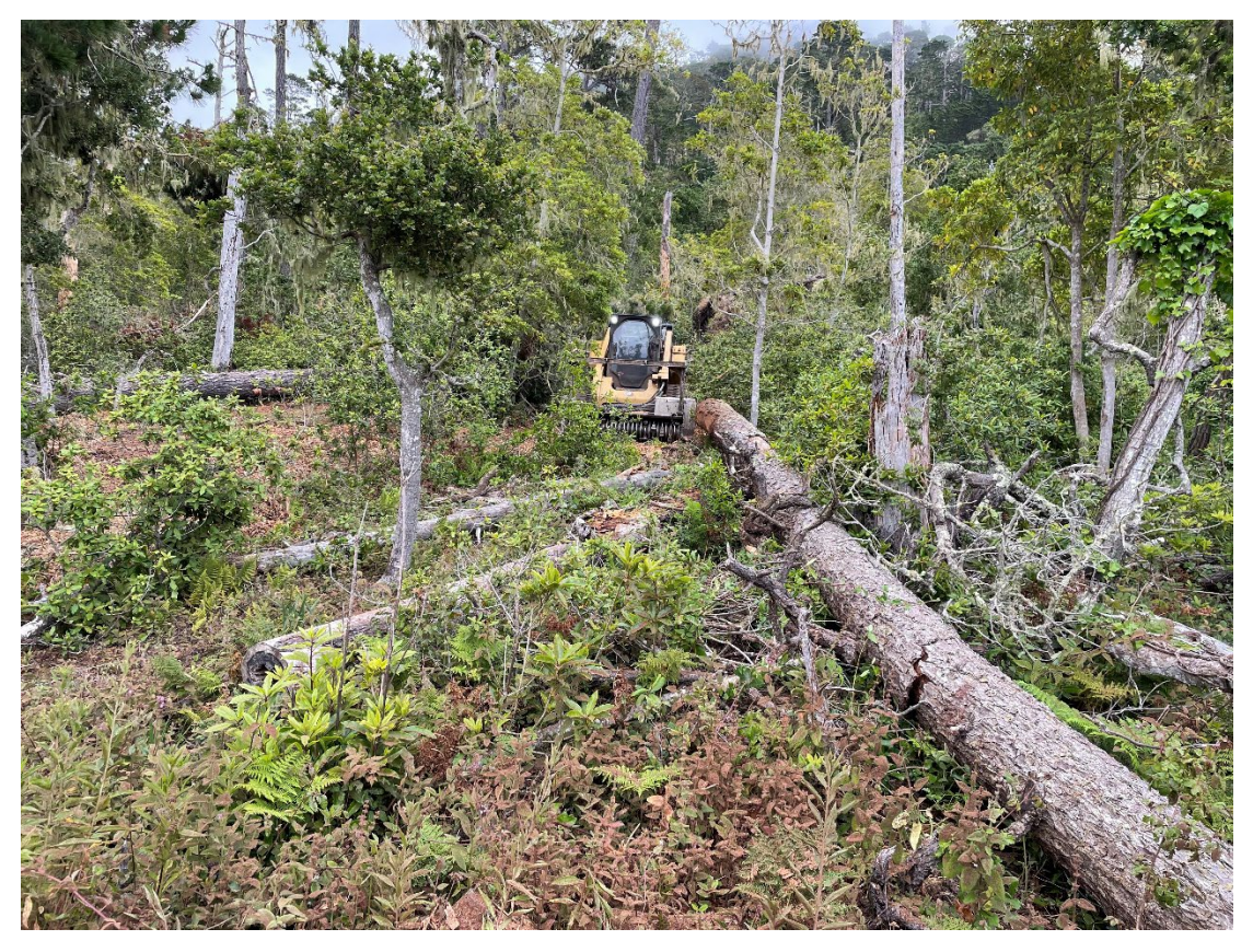
Figure 1: Mastication equipment beginning fuels reduction work.

3. Laidlaw-Apte Vegetation Management Project: Vegetation and fuels reduction work at the Property began on June 14 and, as of writing this report, is expected to be completed by the end of June. Staff have been actively monitoring the work and coordinating with Cal Fire, and the Carmel Highlands Fire Protection District, the consulting forester and equipment operator, and surrounding residents during the course of the project. The project is expected to restore the health of the forest on the property while also reducing the risk of catastrophic wildfire. (Figure 1 and 2)