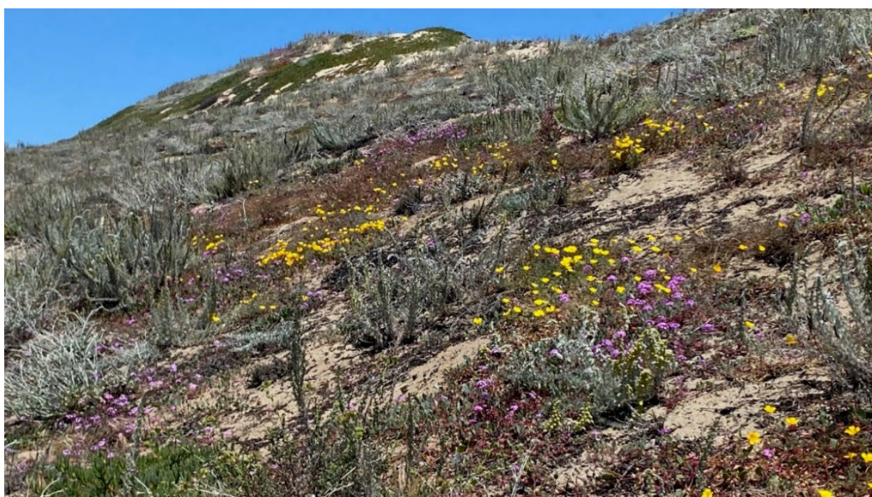
Wildflowers in Marina Dune Preserve as staff prepares to collect specimens for the annual wildflower show..