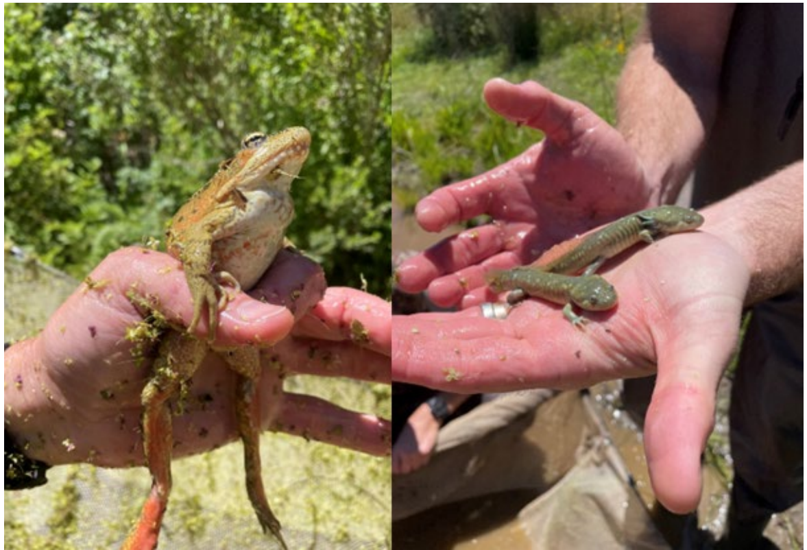
Figure 4: California Red-Legged frog (left) and California Tiger Salamanders (right) found during pond surveys.

6. Staff training: Central Coast Prescribed Burn Association Training Exchange "TREX": Update from June staff report. Due to scheduling conflicts, staff were not able to attend a weeklong training focused on fire and fuel management techniques that was hosted by the Santa Lucia Conservancy in early June.