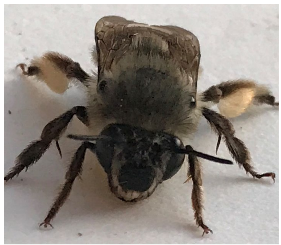
Bumble bee surveyed at Julia Pfeiffer Burns State Park feeding on black sage (Salvia mellifera).