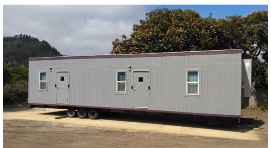
New Ranger Station at Palo Corona Regional Park

The new "temporary" portable office trailer to be used for Ranger staff offices at Palo Corona Regional Park has arrived. It was delivered on June 21<sup>st</sup> and will be located east of the Rancho Canada Unit Maintenance Shop. This unit will accommodate 4 additional work stations, copy machines, and a small meeting room.