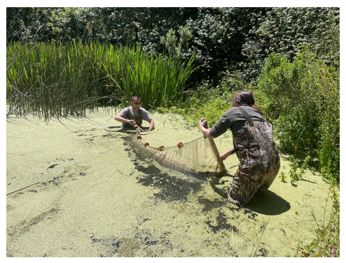
Figure 3: Seine netting surveys at Animas Pond.