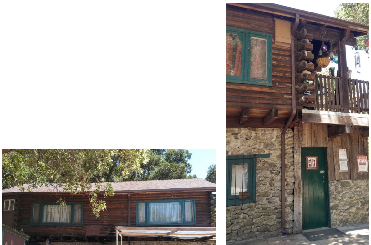
The new Cachagua Community Center Roof w/ gutters and downspouts