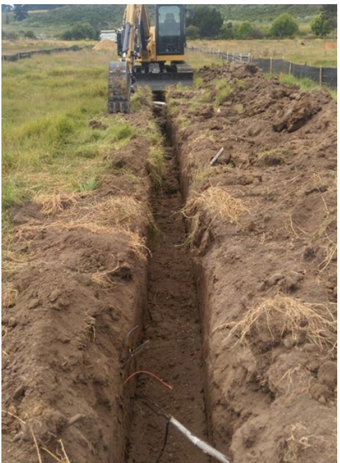
PG&E Trench at RCU Entrance