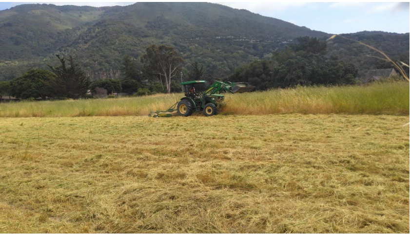
Ranger staff mowing Thomas Open Space

Ranger staff recently mowed Thomas Open Space in Carmel Valley. This project was completed using the District's tractor and rotary deck mower. Ranger staff will continue to monitor growth at this property to determine if it needs to be mowed a second time this season.