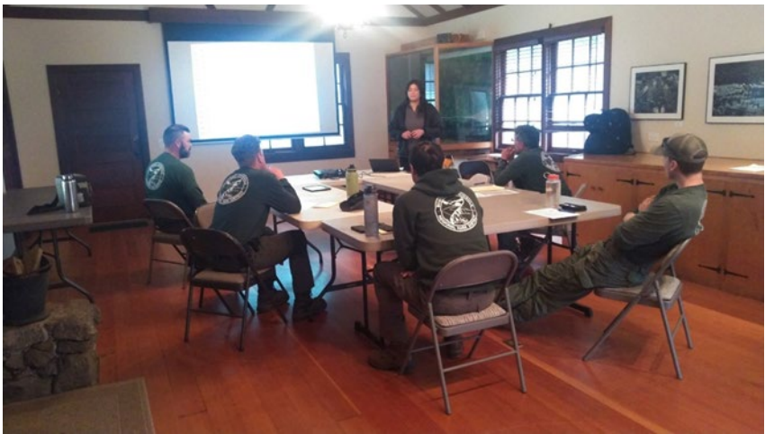
Ranger staff attends training at GRRP

Members of the Ranger staff also attended a tailgate training provided by the District's contracted Biologist to aid personnel in recognizing special status resources that may occur in mowing areas. This training included identification of sensitive species and habitats, a description of the regulatory status and general ecological characteristics of sensitive resources, and review of the limits of construction and best management practices required to reduce impacts to biological resources within the Rancho Canada Unit.