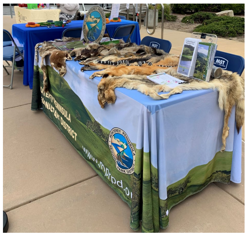
On display are the common animals found along the peninsula.