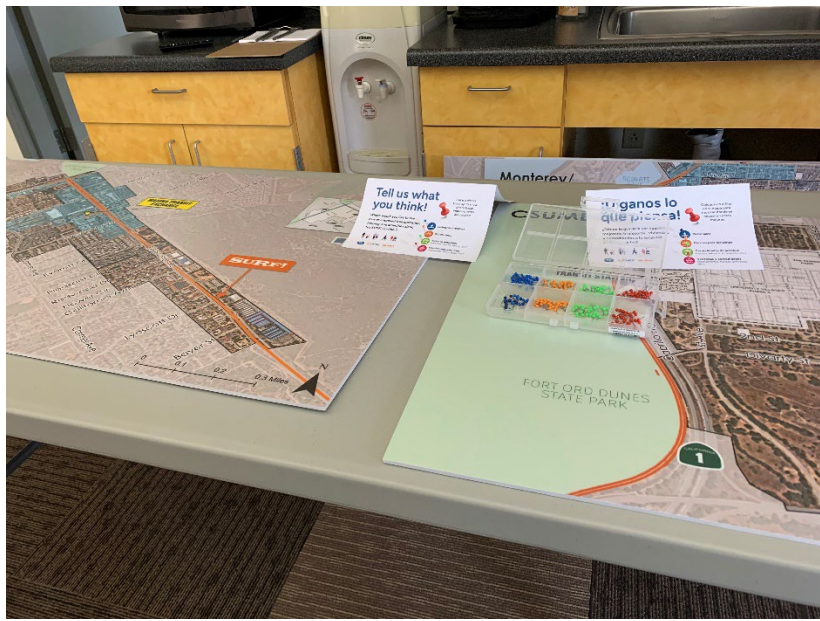
MST staff provide an opportunity for the public to comment on the SURF! project.