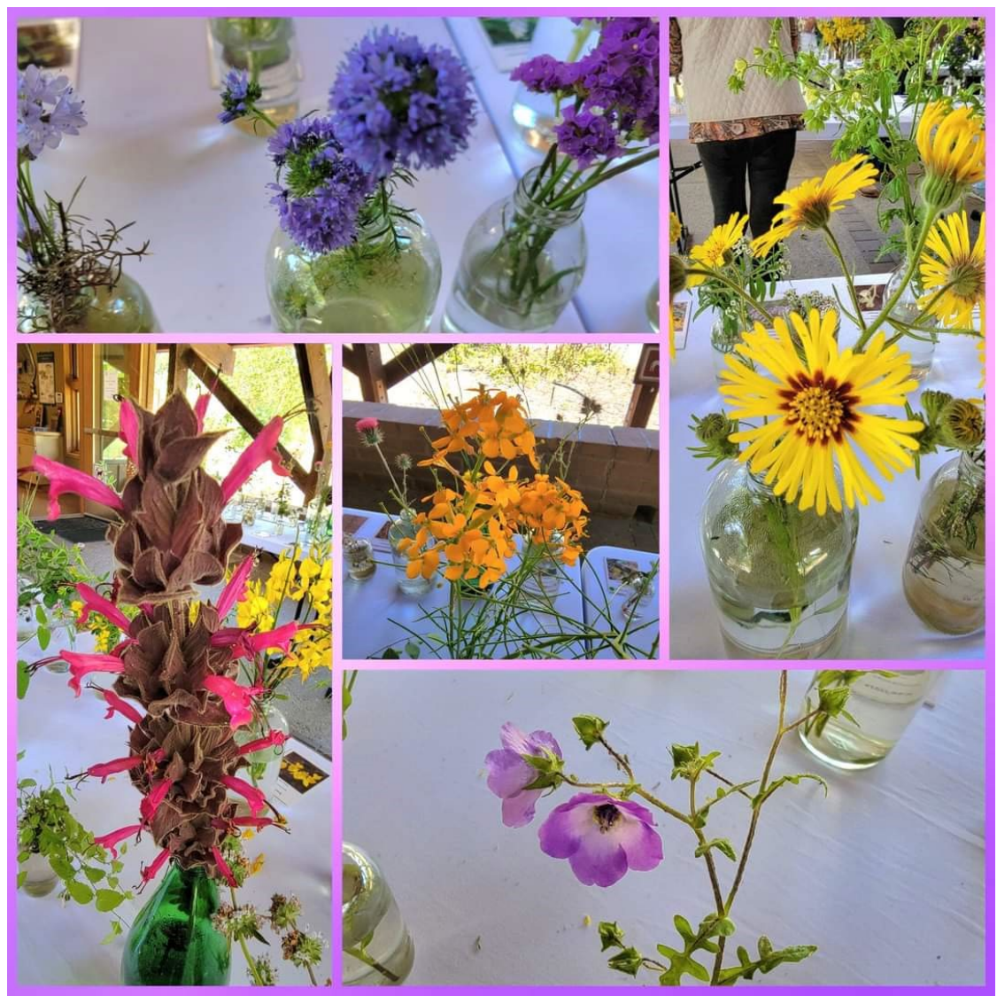
Wildflower Show visitors experienced a diverse array of blooms and colors from MPRPD parklands.