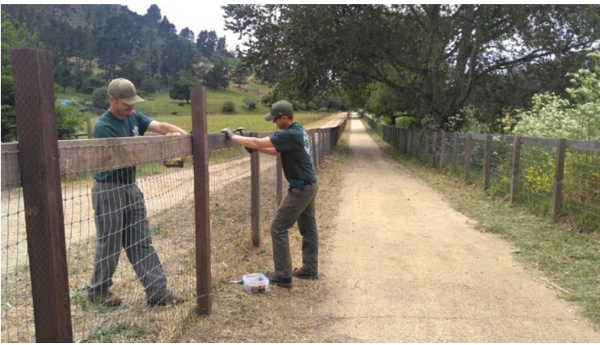
Rangers Hatton and Ira repairing Southbank Trail fence

Ranger staff repaired a section of the Southbank Trail fence recently that began to lean due to multiple broken posts. The materials used originally to construct this fence were untreated, which leads to premature failure. Staff may need to replace this entire fence in the future, based on discussions regarding the trail's alignment.