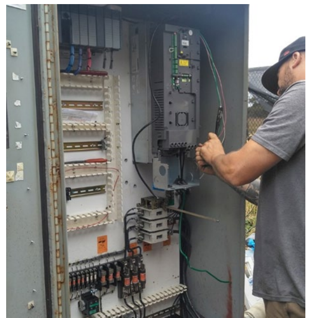
Maggiora Bros. completing pump improvements