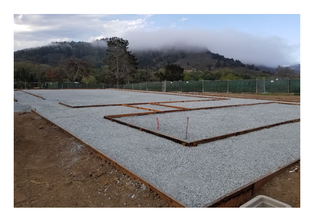
Multipurpose Pad Foundation

promptly contacted and began coordination of measures with regulatory agencies. Updates to the Board will be provided as we learn more.