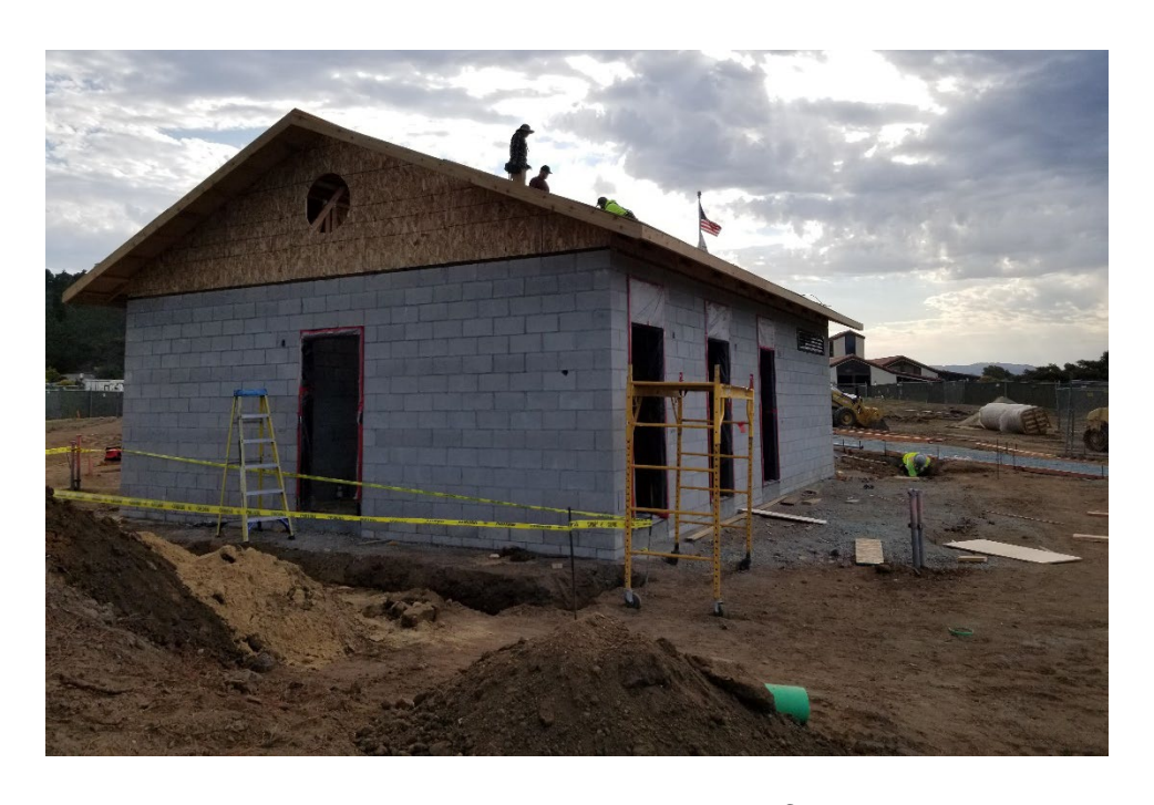
Restroom Building Walls and Roof Framing