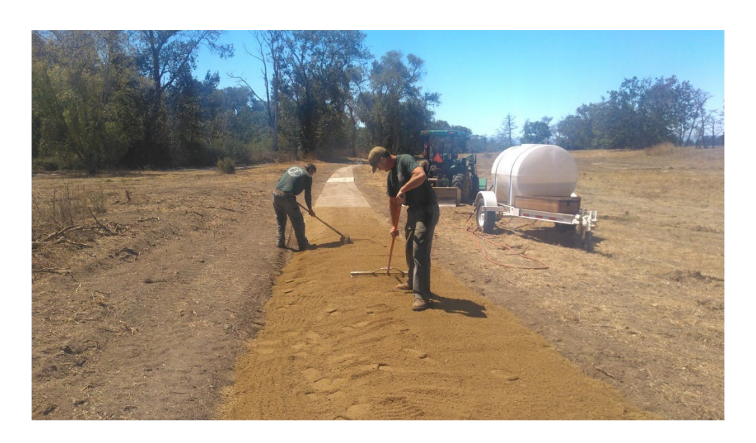
Rangers John and Hatton finish-raking the trail

As part of MPRPD's best management practices for this park, Rangers removed - and continue to remove - extensive sections of broken chunks of the former golf cart paths' in situ concrete and petroleum-based asphalt surfacing by backfilling with permeable, decomposed granite path fines, similar to those used at the region's popular State Parks and Monterey Bay Coastal Recreation trails.