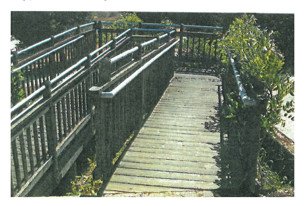
GRRP Ranger Station Wheelchair Ramp to be Replaced

4. Garland Ranch Regional Park (GRRP) ADA Improvements: RGS (MPRPD's consultant), and Operations, Planning & Conservation staff are discussing options for ADA-compliant improvements at the GRRP Ranger Station. Proposed improvements include redesigning and replacing the wheelchair ramps from the parking pad to the meeting room.