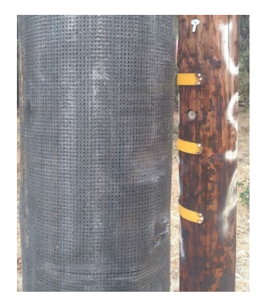
New fire-retardant pole