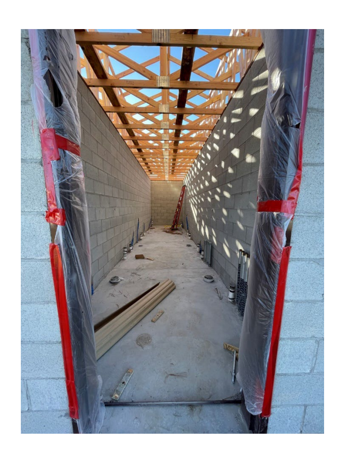
Restroom Building Storage Room Interior Utilities Chase