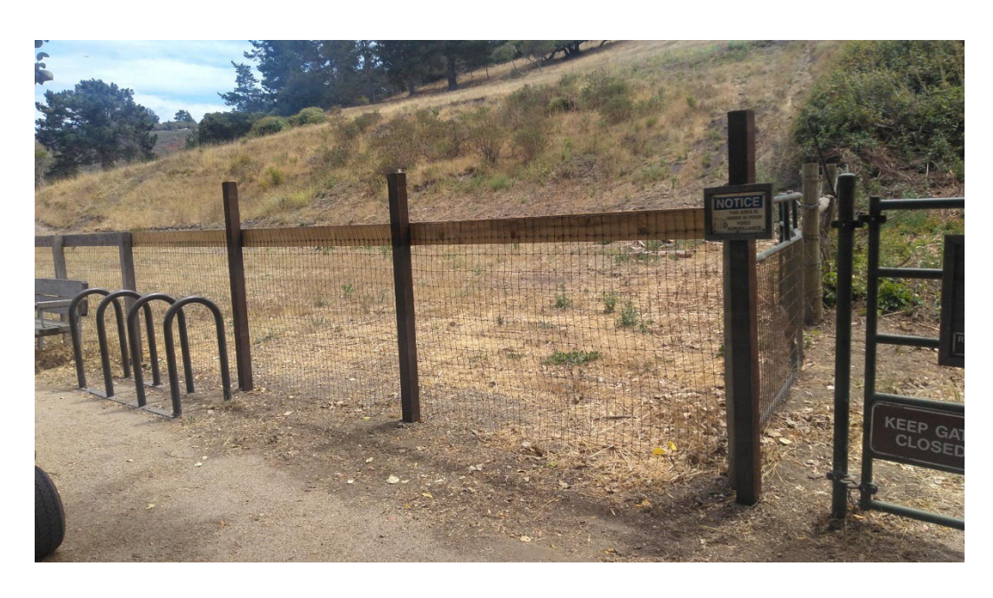
New Section of Southbank Trail Fencing