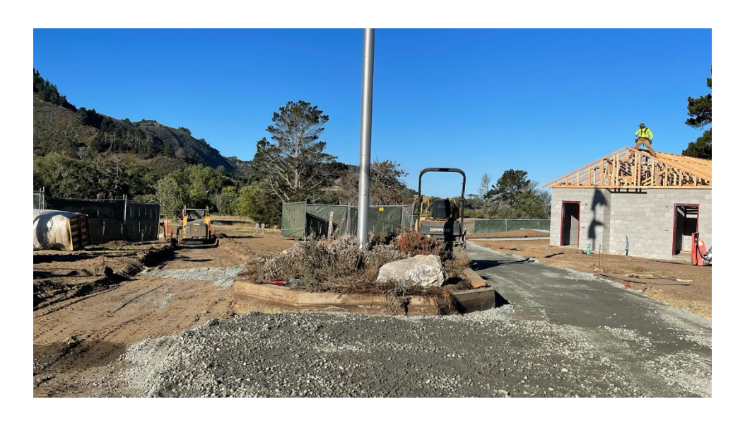
Trail Entrance Improvements Near Extant Flagpole