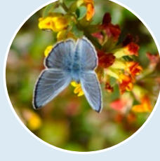
Smiths' Blue Butterfly Euphilotes enoptes smithi