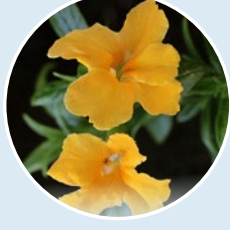
Sticky Monkey Flower Diplacus aurantiacus