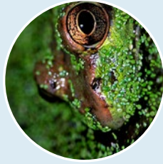
Red-legged Frog Rana draytonii

Home to steelhead trout, rare amphibians and a variety of raptors, wildlife can be found nesting and feeding throughout the forest and grasslands. Some animals found in the park include: deer, mountain lion, bobcat, black bear, California condor, golden eagle, peregrine falcon, and spotted owl.