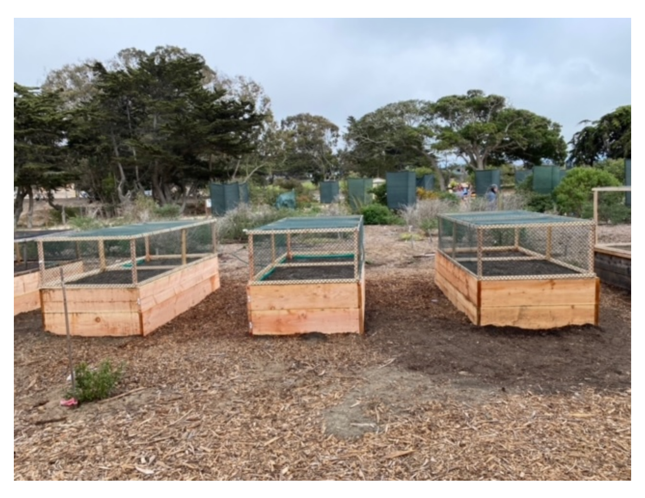
Eagle Scout Candidate Antony Ortiz's Completed Raised Planter Boxes