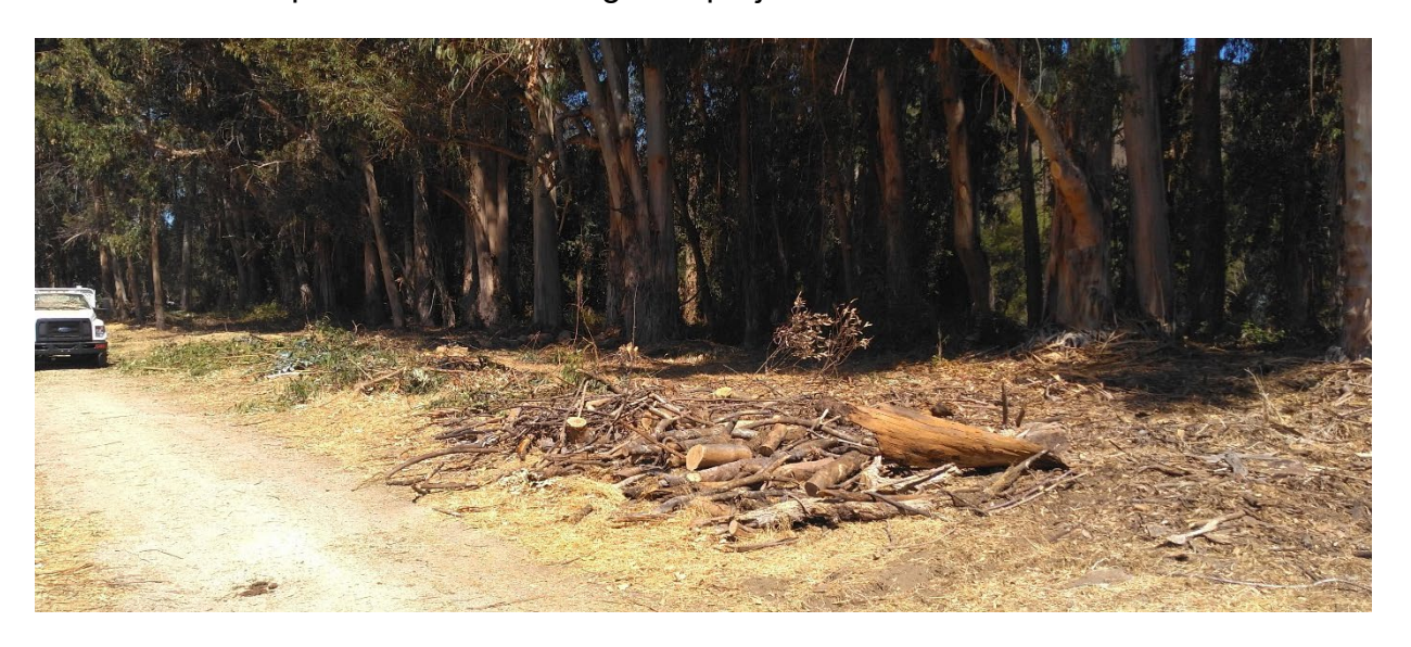
A newly constructed 30' fuel break along the Rancho Loop Trail

3. Fuel Mitigation and Fire Management Plan for Garland Ranch Regional Park: The District continued to make process of developing an RFP for the Fuel Mitigation and Fire Management Plan (Plan) for Garland Ranch Regional Park. As previously reported, MPRPD's Board previously authorized Fiscal Year 2021-22 funds for this Plan and the park's initial fuel mitigation project.