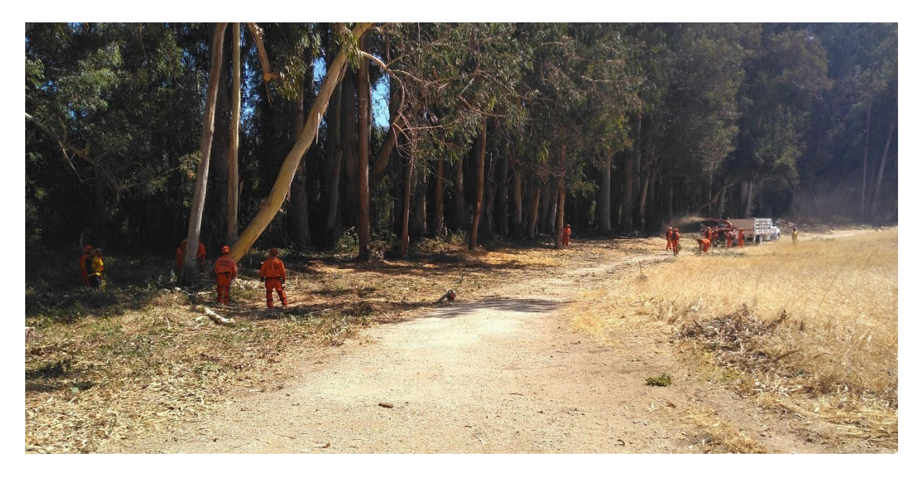
Gabilan Conservation Camp Inmate crew chipping brush and raking along the Rancho Loop Trail